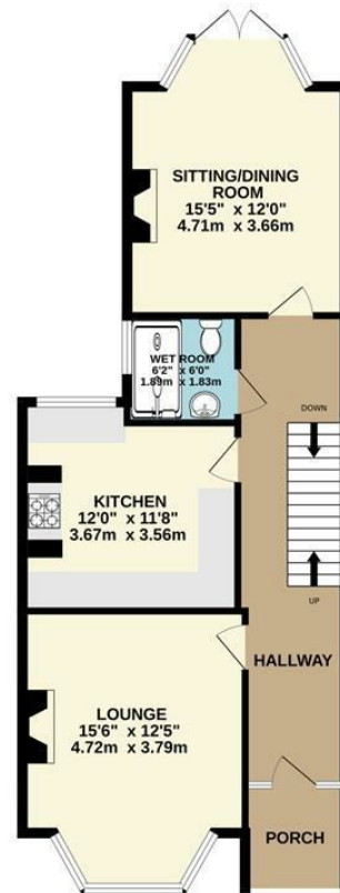
GROUND FLOOR 709 sq.ft. (65.0 sq.m.) approx.