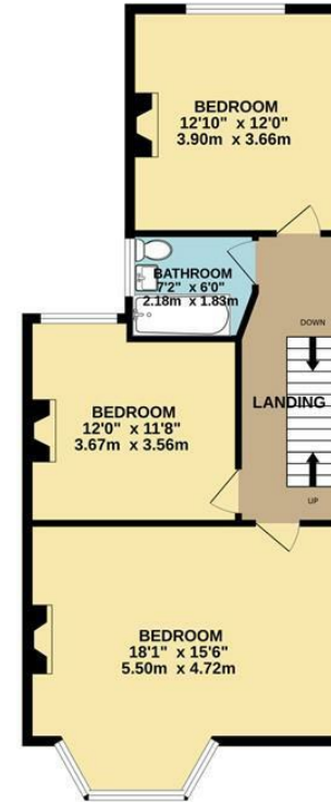
1ST FLOOR 670 sq.ft. (62.2 sq.m.) approx.